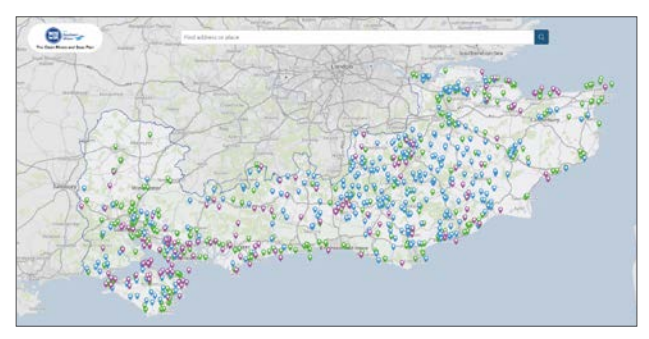
Above: Clean Rivers and Seas Plan

Event duration monitoring helps us to understand the performance of our storm overflows. It is a vital part of our response to managing their frequency and to reduce our impact on bathing water quality. We now have 100% Event Duration Monitoring installed, and the data produced by the monitors is shared with the Environment Agency annually and via our new Clean Rivers and Seas Watch customer webapp.